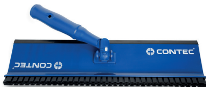
Multi-Purpose Frame - PRMH2007

The ultimate 3-in-1 tool: a broom, a squeegee, and a mop.